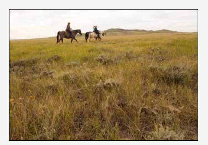
Britton Blair and his dad and uncle have seen significant changes in forage diversity, rainfall infiltration, and grassland resilience over the past 20 years by using more intense rotational grazing.

Remember the R's • Page 2 Remember the R's • Page 3