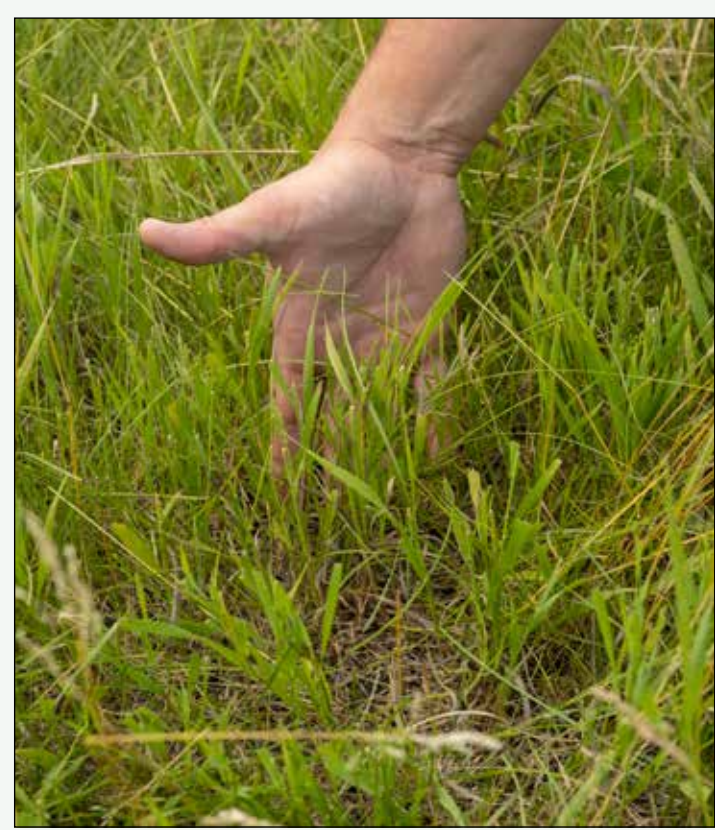
A key to rotational grazing is leaving a healthy amount of grass at least 4 inches, generally—after grazing to allow plants and roots to rest and recover, and feed microbes.